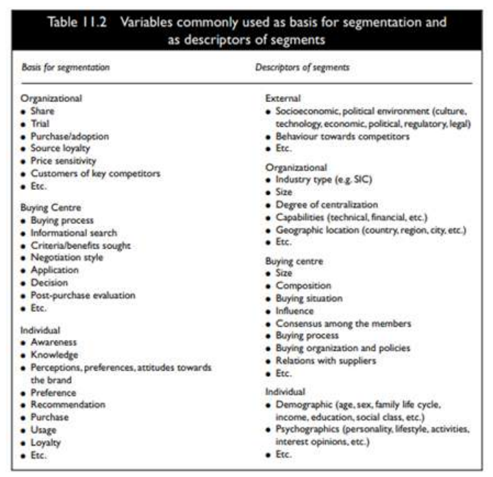
Figure 11.1 Source: Market egmentation YORAM (JERRY) WIND and DAVID R. BELL

The determination of which set of variables – basis – to use for segmentation of the market is critical. Conceptually, the guiding principle is fairly obvious. A good segmentation variable is one that explains variation in use of the firm's products and services